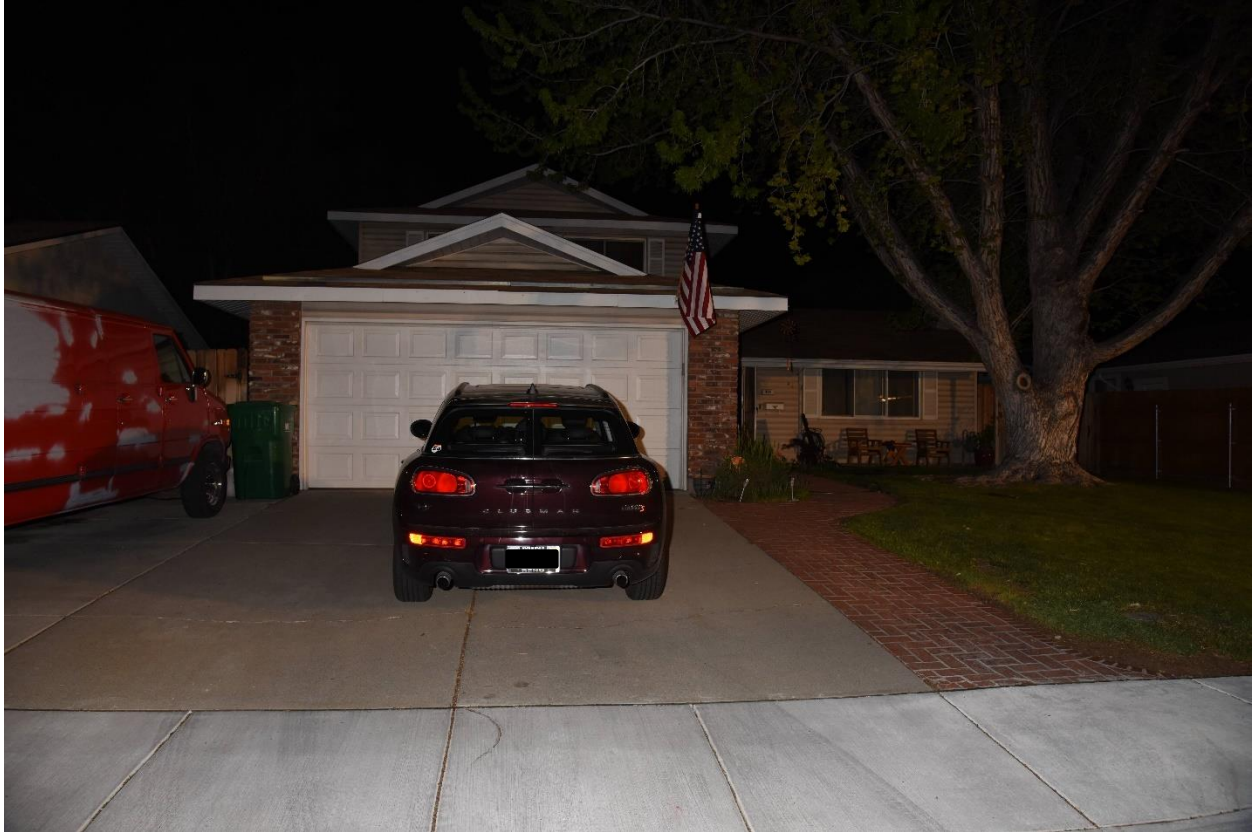
(Front of 414 Abbay Way)

Two vehicles were parked in the paved portion of the driveway, with the front ends of both vehicles facing the closed garage door. Facing the house, the vehicle on the left was a red van and the vehicle on the right was a maroon Mini Cooper.