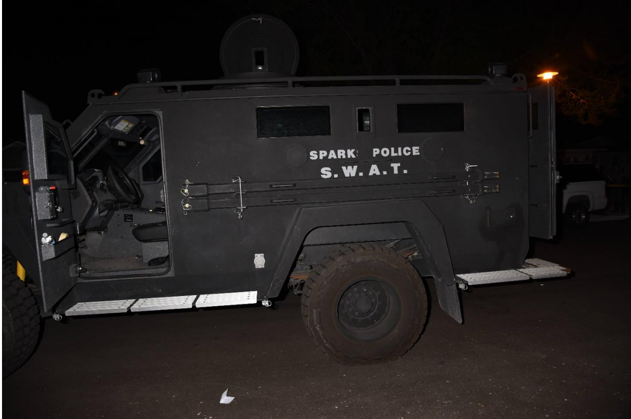
(SPD SWAT BearCat)