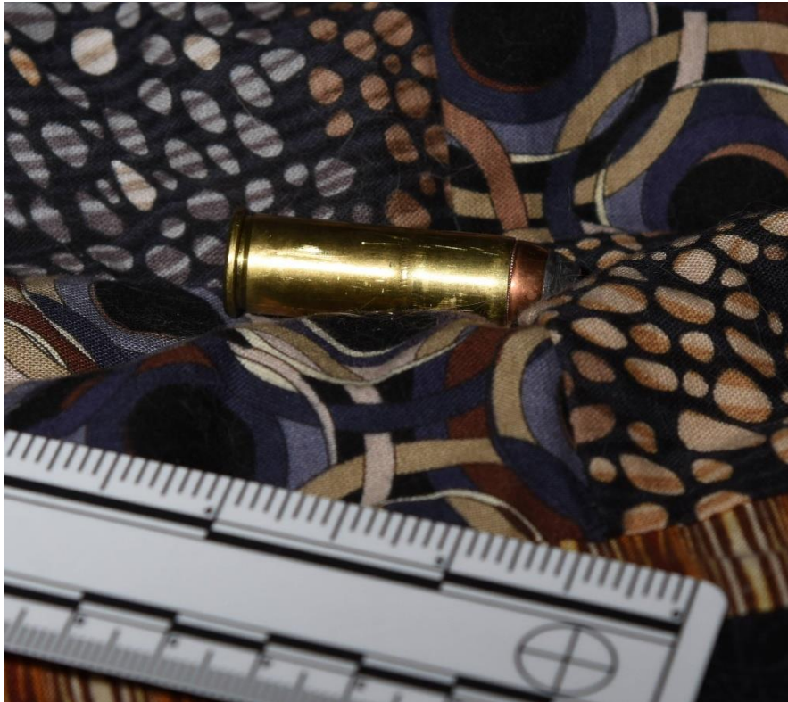
(Ammunition found on floor of Dominguez's room)

On February 11, 2020, Firearms Examiner Ron Freels reported the results of an examination of the above firearm. Freels determined that the "Marlin Model 1894SS Cal. 44 REM: rifle (serial number 91201128) was in normal operating condition with no noted malfunctions.